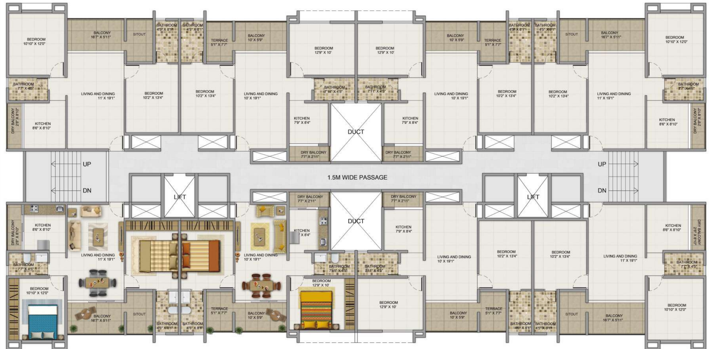
EVEN FLOOR PLAN